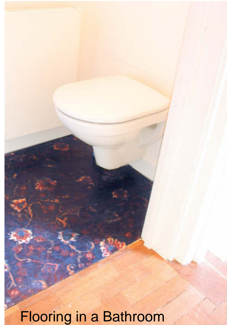
Flooring in a Bathroom

Low maintenance. Fixed using general fastenings