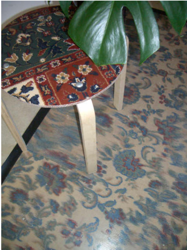
Stool and floor matt