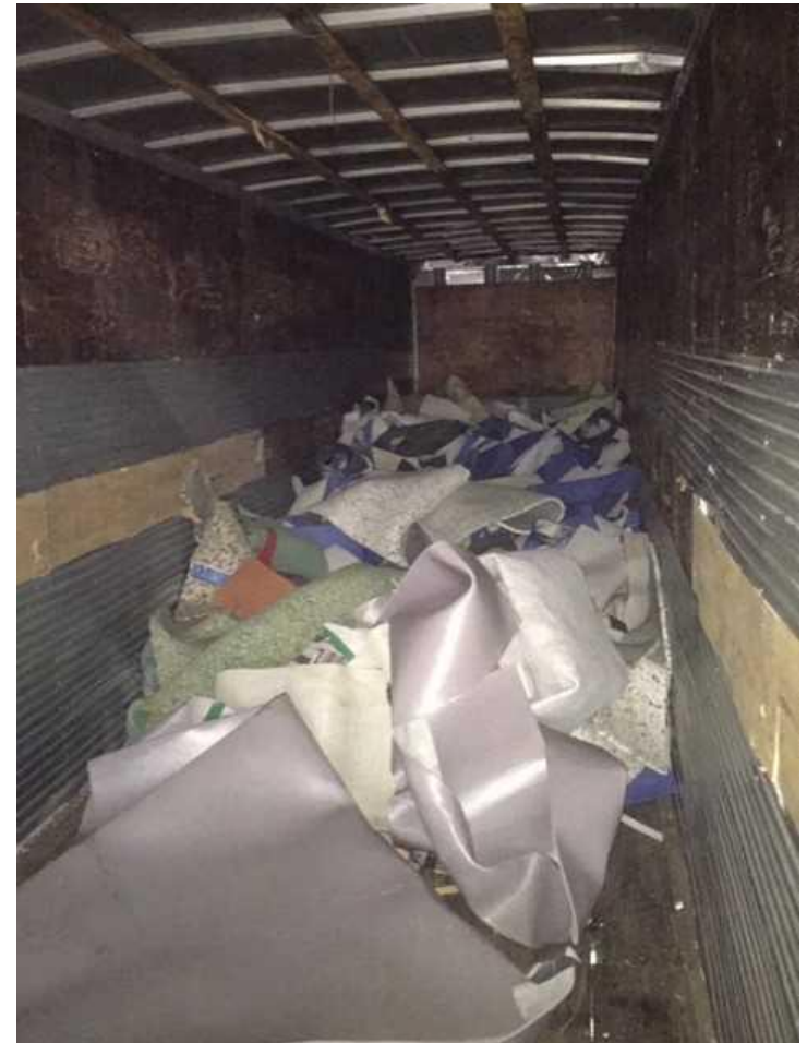
Total carpet & pad scrap from Greenbuild. Sent to waste to energy. Picture credit: VP of Sustainability, Freeman 11/20/2018