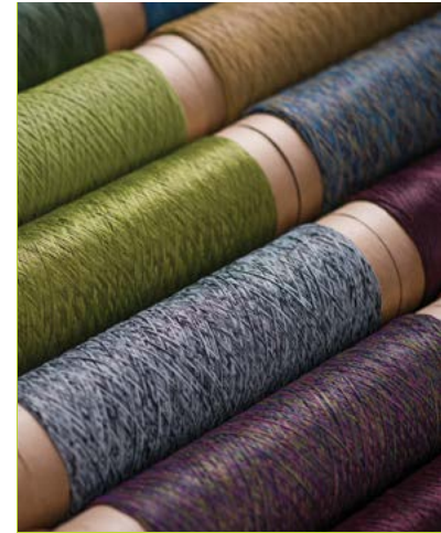
Recycled carpet fibers are turned back into thread to be used in carpet or other materials.

The funds collected from the assessment are directed to a set of incentives for collectors, sorters, processors and manufacturers involved in the recycling of post-consumer carpet into new products.