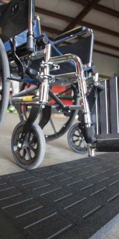
Carpet is recycled into many useful products, including wheelchair ramps and automotive parts.